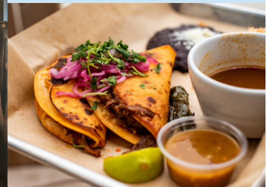
Bellevue Brewing has delicious bites to go with all their topnotch beers!