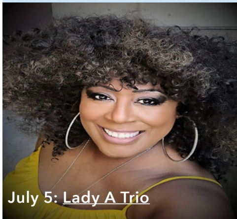
July 5: Lady A Trio

July 5 & 19 between 12:00pm-1:00pm The Spring District is hosting Lunchtime Concerts in conjunction with Bellevue Beats & Bites summer concert series .