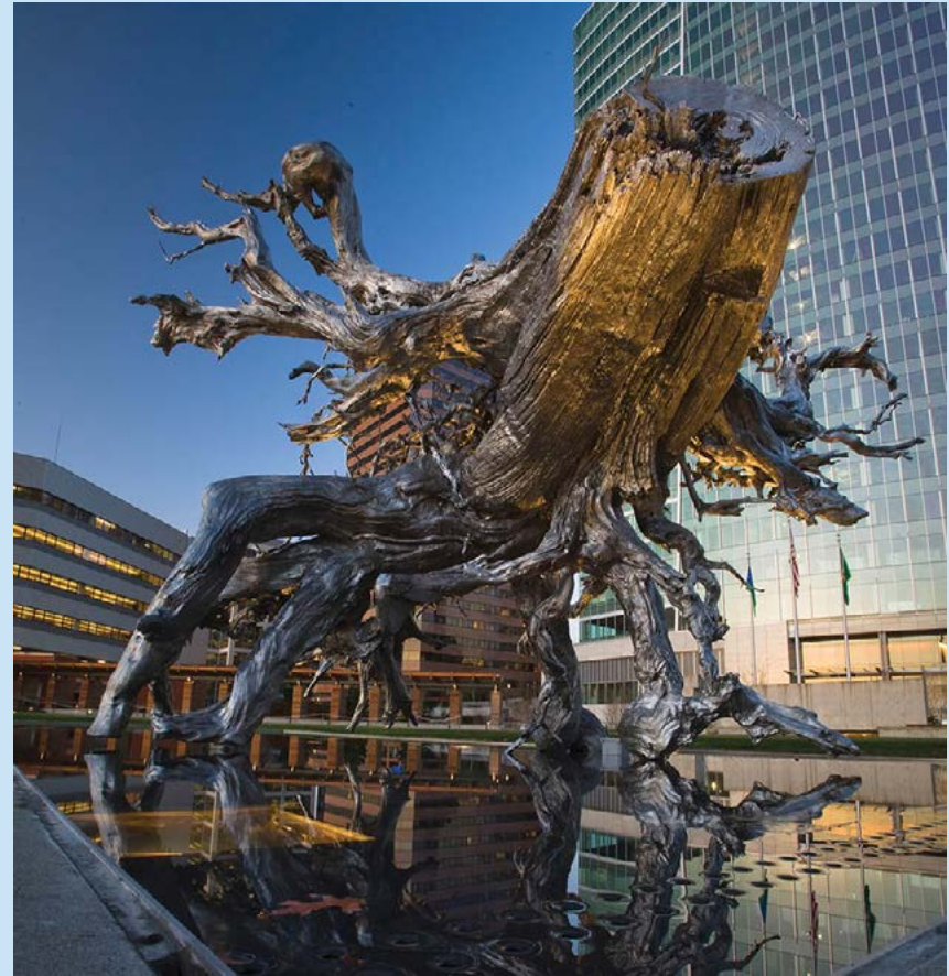
ROOT - MICROSOFT BUILDING

The full Bellevue Art Map gives you an organized presentation of over 100 pieces of public art. Now get out there and explore the artsy side of Bellevue.